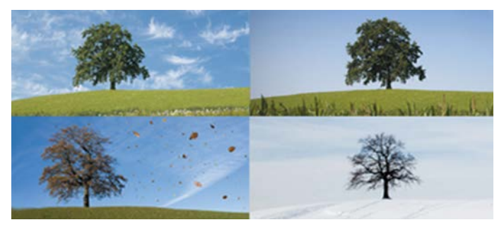
Newly effective standards