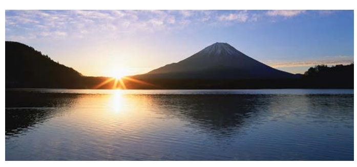
Presentation and disclosures