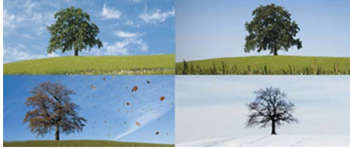
Newly effective standards