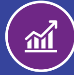
Data and reporting layer