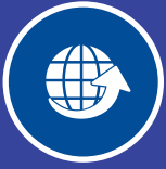
Service delivery model layer

A global mobility operating model is multilayered and should be designed to integrate holistically with other related components and aligned as a whole to the organization's overall business and talent strategy.