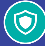
Governance/ controls layer

Within the service delivery model layer, our managed services methodology, scalable approach underpinned by our industry-leading LINK Work Force technology suite delivers an integrated services delivery framework to streamline your day-to-day talent mobility administration, enhance employee experience and support your global compliance objectives.