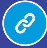
Functional process layer