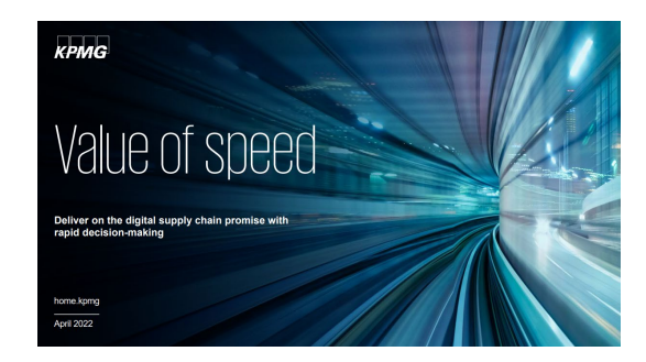
To read more, click on the image above