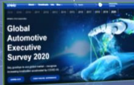
INTERACTIVE ONLINE VERSION