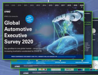
THIS PRESS DOCUMENT WITH KEY MESSAGES