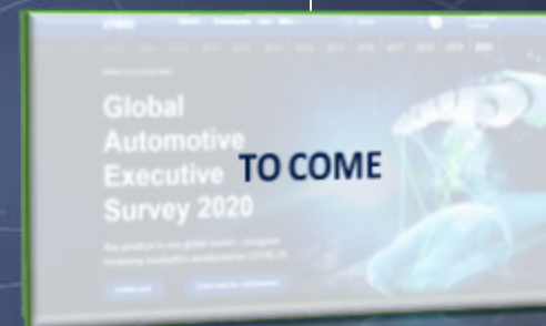
EXECUTIVE SUMMARY WITH TOPICS THAT CATCH THE MOST INTEREST AMONG OUR READERS